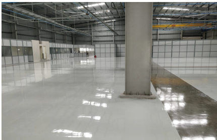
Epoxy Flooring at JJ Glastronics

"15 years back when we started with Ardex Endura our initial focus and attention was specifically to waterproofing portfolio focused on Builders segment. Progressively, Ardex Endura encouraged us and trained in application and technologies of various products like cementitious underlayments, Epoxy and PU concrete flooring. They gave us a complete backup by giving extensive training to our team. With this backup, we were able to expand our product services to more customers."