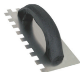
12mm x 12mm Square notch trowel