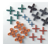
Spacers 2,3,4,5,8 & 10mm